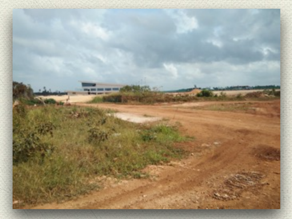
Zanzibar Terminal 2, 2019