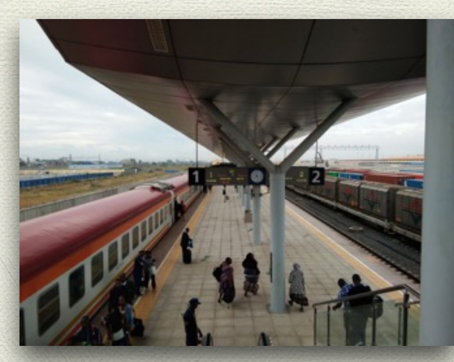
Nairobi SGR, 2019