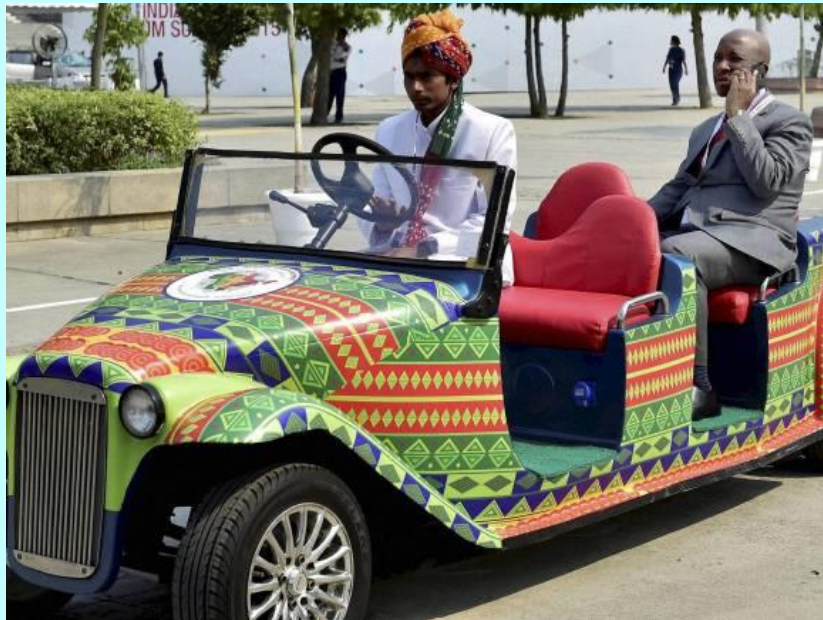
India-Africa Summit Forum, New Delhi 2015