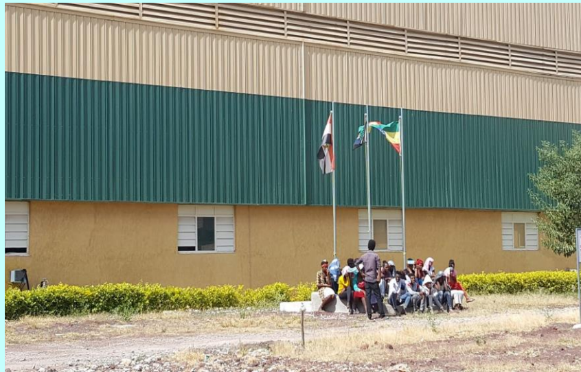
The Strike on October 26, 2018