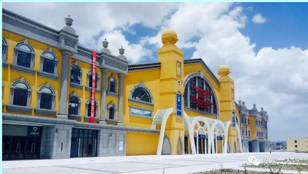
Bishoftu station in the Djibouti train line