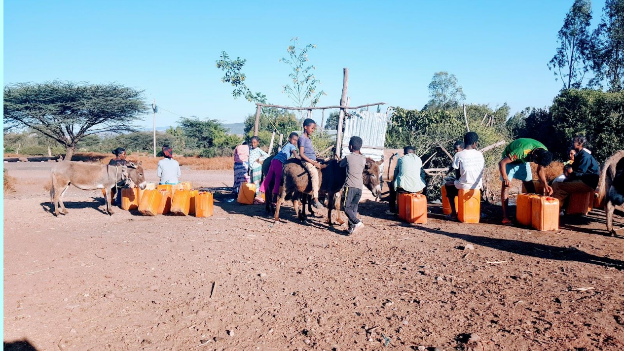
Children in Delo village using the Kanoria water pump